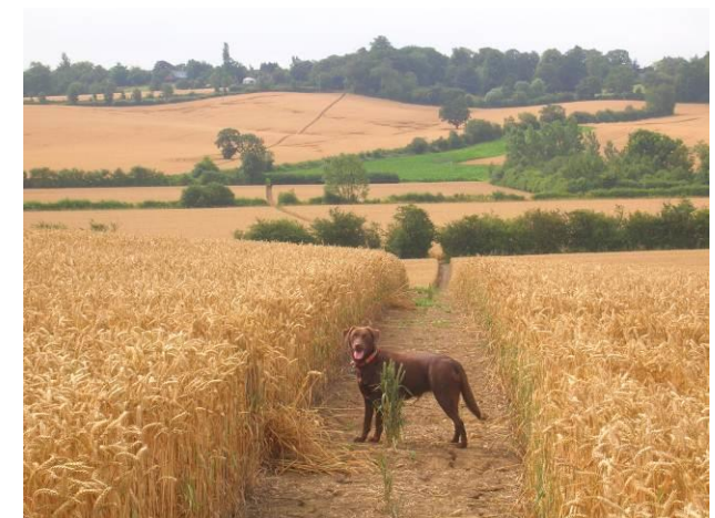
View of path back towards Toddington

Farm livestock may be in some of the fields you cross, so dogs must be kept under close control. There are three stiles to climb and the many arable fields may be muddy in places, particularly after ploughing. Much of the walk is over land managed by Heathcote Farm Ltd who request you support their environmental work by respecting the county code.